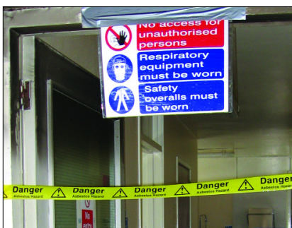
Make sure you restrict access