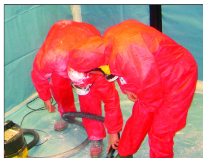
'Buddy' cleaning using a Class H vacuum cleaner