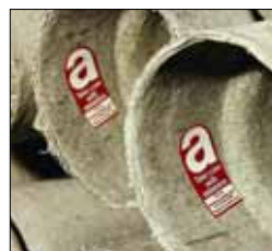
These asbestos cement pipes are labelled, so are the tiles, but you might not know until you start to lift them.