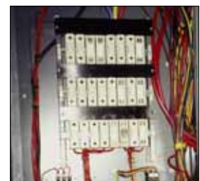
Asbestos isn't always obvious. Would you spot an asbestos gasket on an old engine, asbestos cement pipes or an asbestos-containing fuse-board? If you're not sure, the premises owner needs to get it checked out!