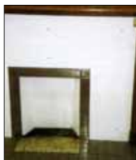
Asbestos insulating board (AIB) fire surround