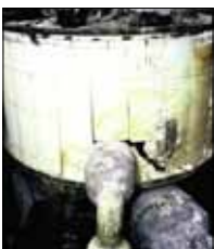
Asbestos lagging on an old tank