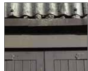
There could be sprayed limpet under this asbestos cement (AC) sheeting