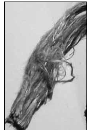
There are three 'colours' of asbestos, but you can't tell just by the colour what you have found; it could be mixed with other ingredients which change the appearance.