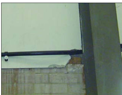
This damaged AIB needs to be covered and protected from further damage