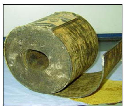
Floor tiles that contain asbestos can also have asbestos-paper backing, or be fixed with asbestos-containing mastic