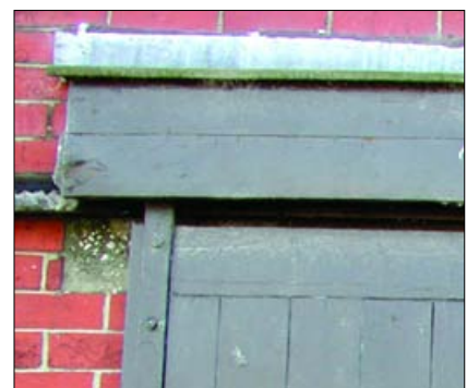
Built up bituminous roofing and bituminous asbestos fabric over a doorway