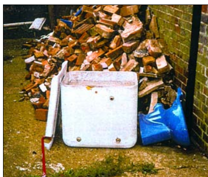
An AC water tank