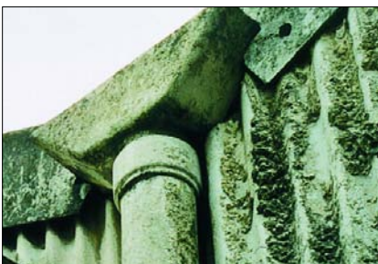
Moss and lichen growth on asbestos cement